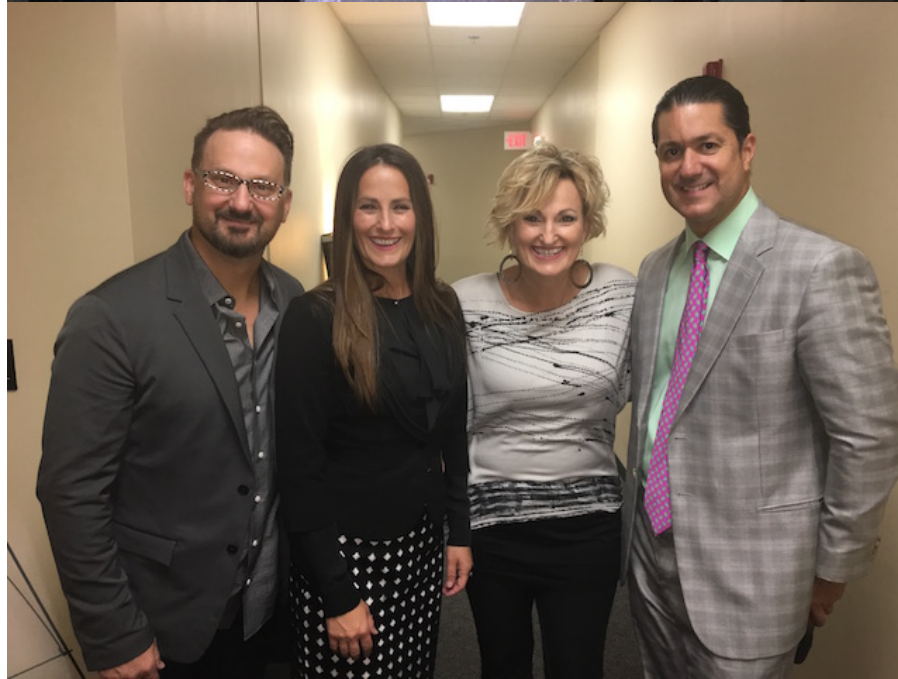
We had nearly a full house for Selah's stirring and powerful concert!